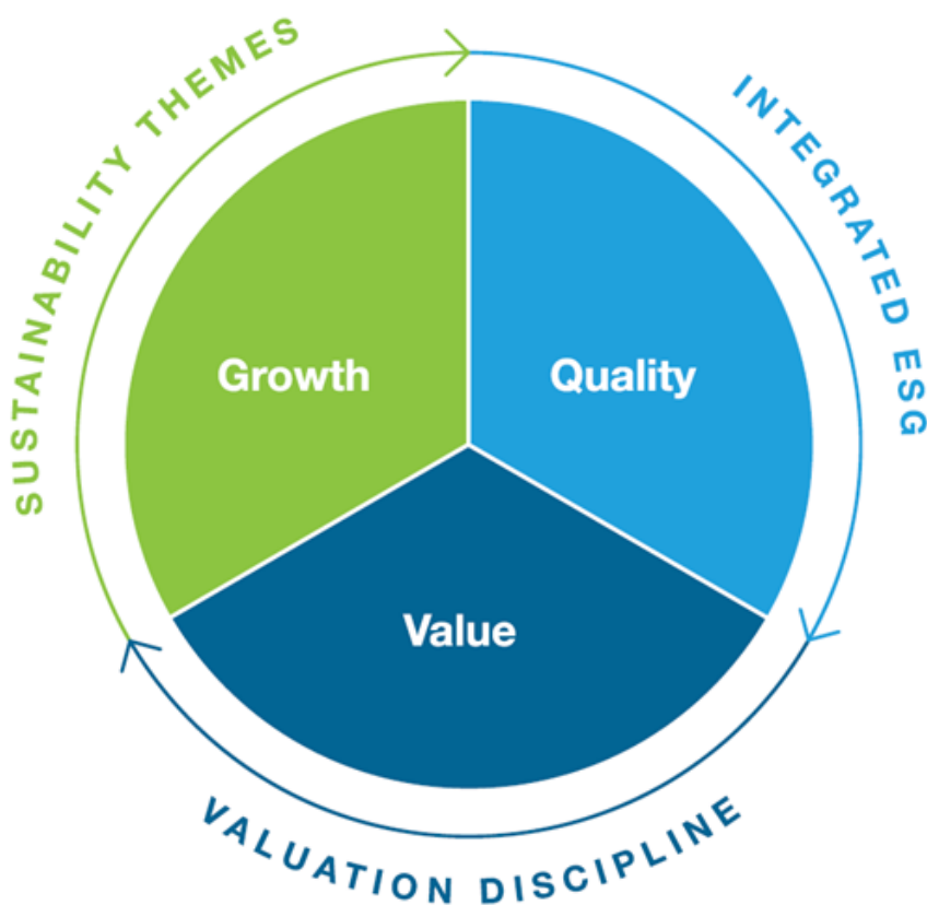
WHEB'S INVESTMENT PHILOSOPHY

You should read the important additional information about "Benefits of investing in the Pengana WHEB Sustainable Impact Fund" in section 3 of the Fund Product Guide before making a decision to invest in the Fund. Go to pengana.com . The material relating to these matters may change between the time you read this PDS and the day when you acquire the product.